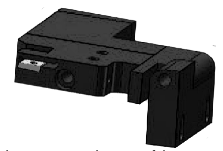
The chopper system pivots out of the way to enable quick die changeovers